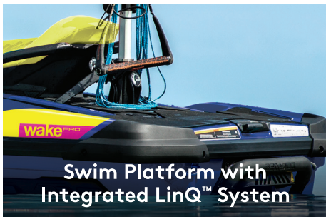
Swim Platform with Integrated LinQ™ System

Exclusive quick-attach system on the largest swim platform in the industry that allows for easy installation of accessories. 1