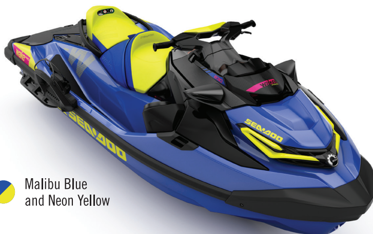
Malibu Blue and Neon Yellow