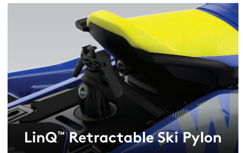
LinQ™ Retractable Ski Pylon

The industry-first manufacturer-installed, truly waterproof, Bluetooth ® audio system. 2